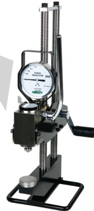
ISHB-H131 HYDRAULIC BRINELL HARDNESS TESTER OPERATION MANUAL