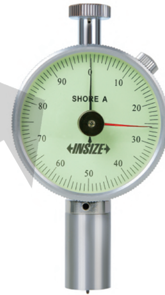
ISH-SAM SHORE DUROMETER OPERATION MANUAL