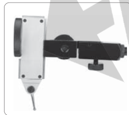
holding dovetail groove