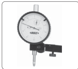
holding stem \Phi 8\text{mm}